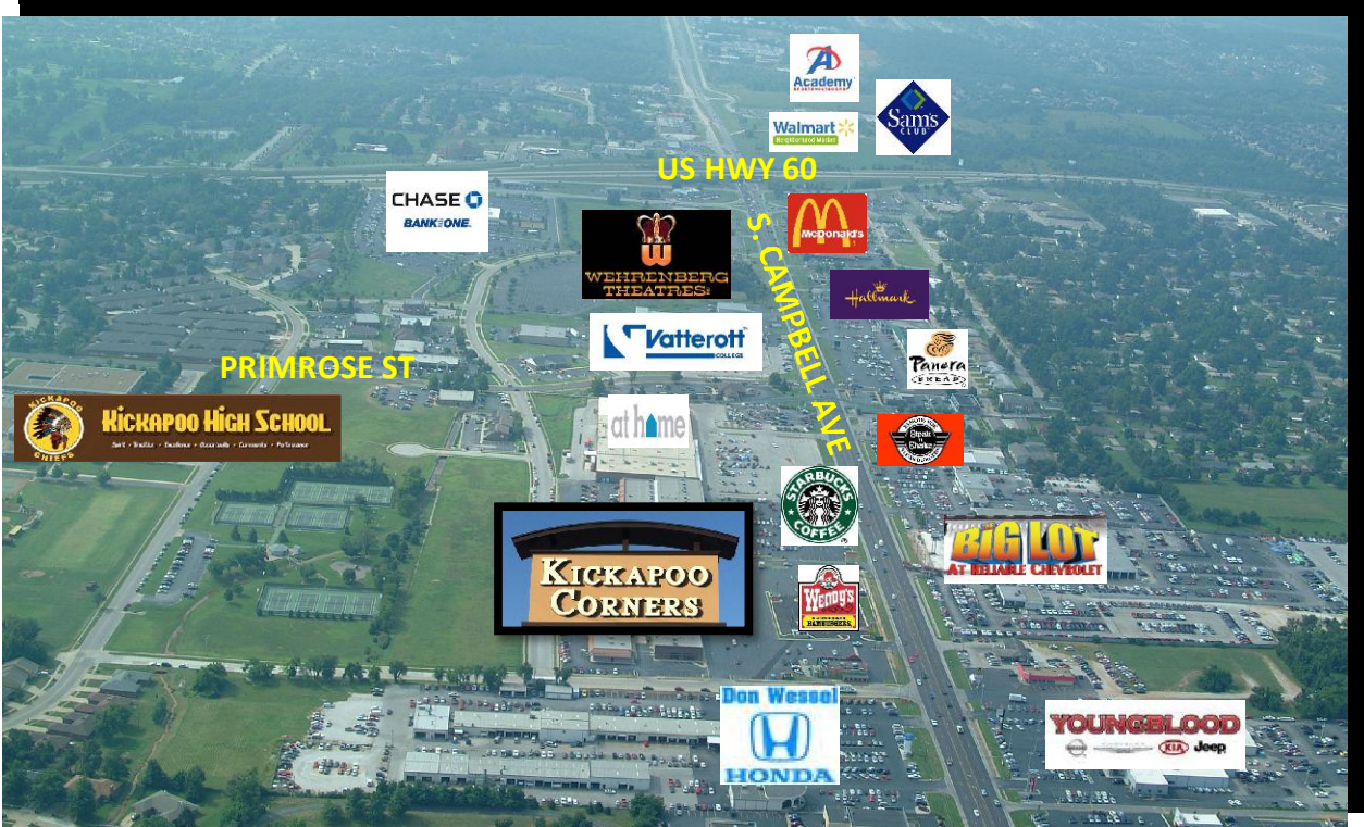
Kickapoo Corners View to the South